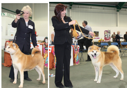
Veteran Bitch (left): Hana Go Musashi Aiwa At Wendbarry Veteran Dog: Takamaru Go Of Kamino Ken at Wendbarry

The Club would like to congratulate all the dogs and owners who took part and hope that you had an enjoyable day. If you have any comments or suggestions on how to improve the event please contact the secretary .