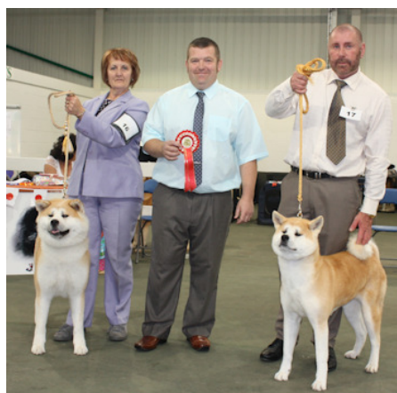
Best Bitch (left): Kita Go Dell'Antico Oriente Tsoyu (Imp ITA) Reserve Best Bitch: Wendbarry I Am A Celebrity with Norvanik