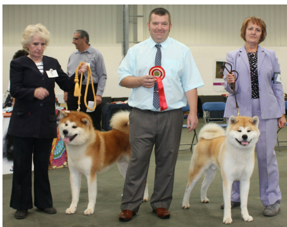
Best of Breed (right): Tsoyu Amatsu-Kami Reserve Best Dog: IR CH Kaidou Go Shirai At Wendbarry

It was a pleasure to judge this well run club show. This is a relatively new breed and it was a pleasure to see the depth of quality in the breed. The future looks bright, and keep up the good work that is being done. Thank you to everyone for the warm welcome and also thank you to my able stewards for the sterling job.